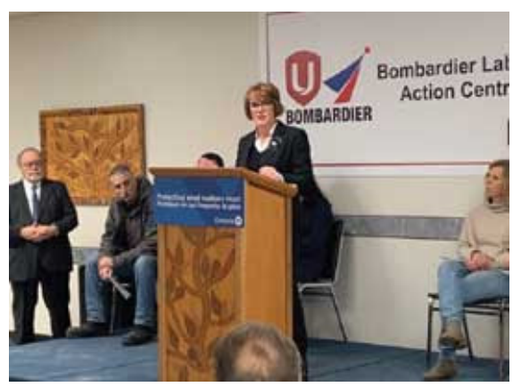
Three Unifor Action Centres in Oshawa and Thunder Bay will continue to support laid off workers in 2022 after the union successfully pushes the Ontario government to extend their operations.