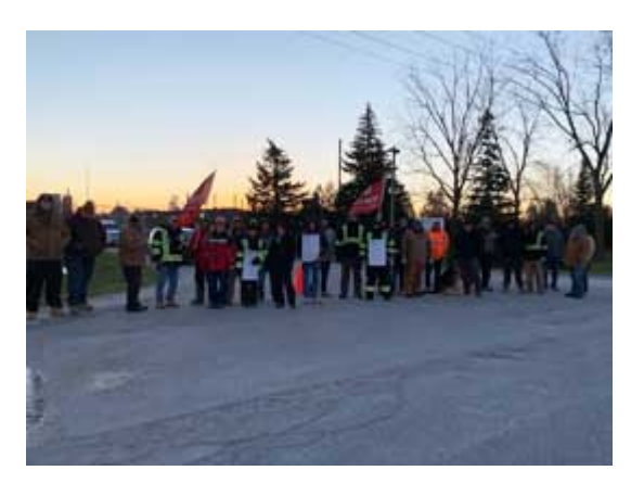
Unifor Local 914 members who treat