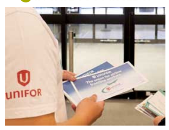
As bargaining continues for the first Unifor collective agreement at WestJet, watch the video about how the workers in Vancouver and